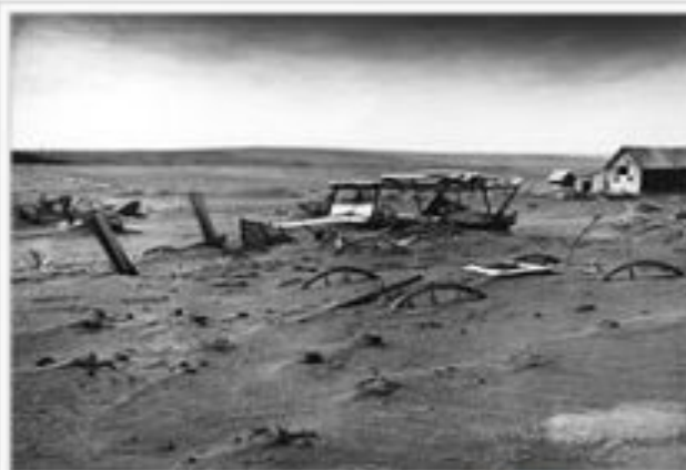
Buried machinery in a barn lot, South Dakota, May 1936. The Dust Bowl on the Great Plains coincided with the Great Depression. [55] [56]