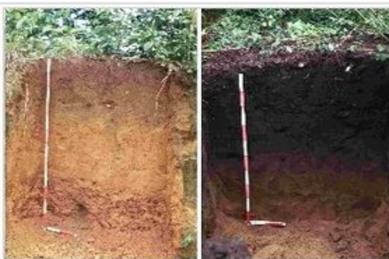
Left - a nutrient-poor oxisol; right - an oxisol transformed into fertile terra preta

Terra preta was created through the introduction of wood charcoal, pottery shards, bone, and manure to the soil. This soil amendment is so powerful and beneficial that "Thousands of years after its creation it has been reported to regenerate itself at the rate of 1 centimeter (0.39 in) per year[8]..."