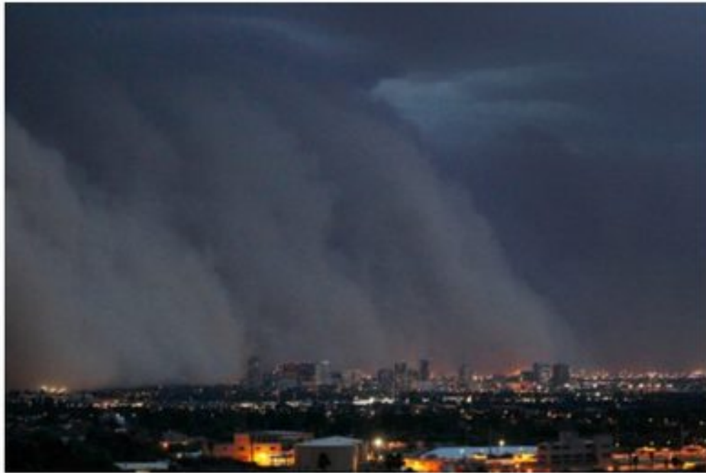
ORIGINAL CAPTION: A giant dust storm covers Phoenix, Ariz., late on July 5. (Rob Schumacher / The Arizona Republic). http://standeyo.com/NEWS/11_Pics_of_Day/110706.pic.of.day.html